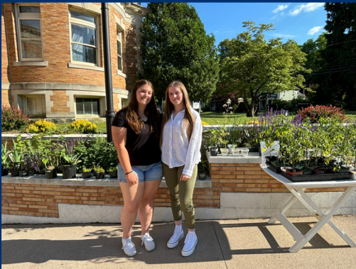
2024 College Scholarship Winners

Volunteer Powered, Community Funded Nonprofit